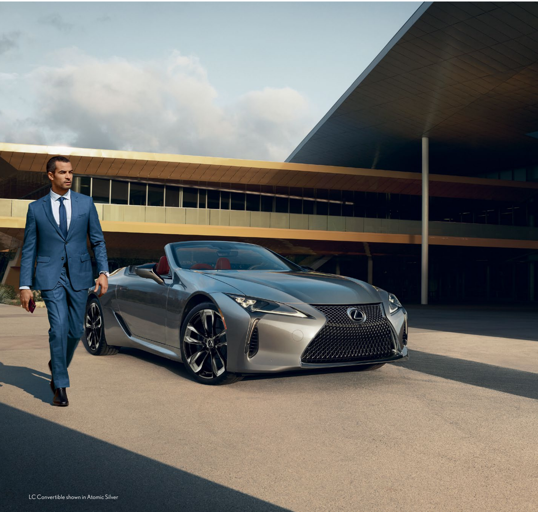
LC Convertible shown in Atomic Silver