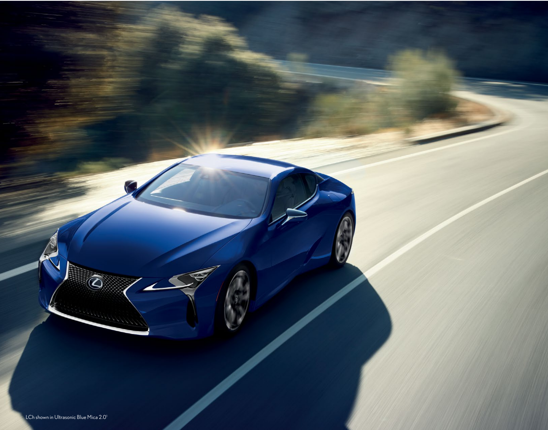
LC shown in Ultrasonic Blue Mica 2.0 1