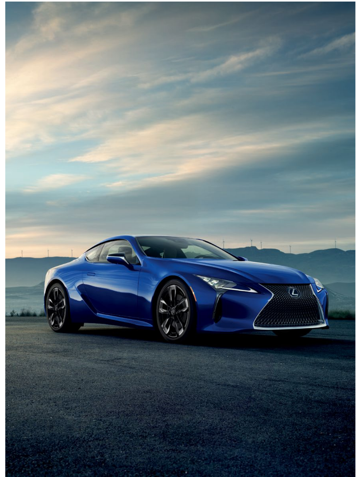
LCh shown in Ultrasonic Blue Mica 2.0 1

From the customizable Bespoke Build models to the thoughtful details you'll discover in the incomparable LC Convertible, every element is designed to elicit a response from the driver.