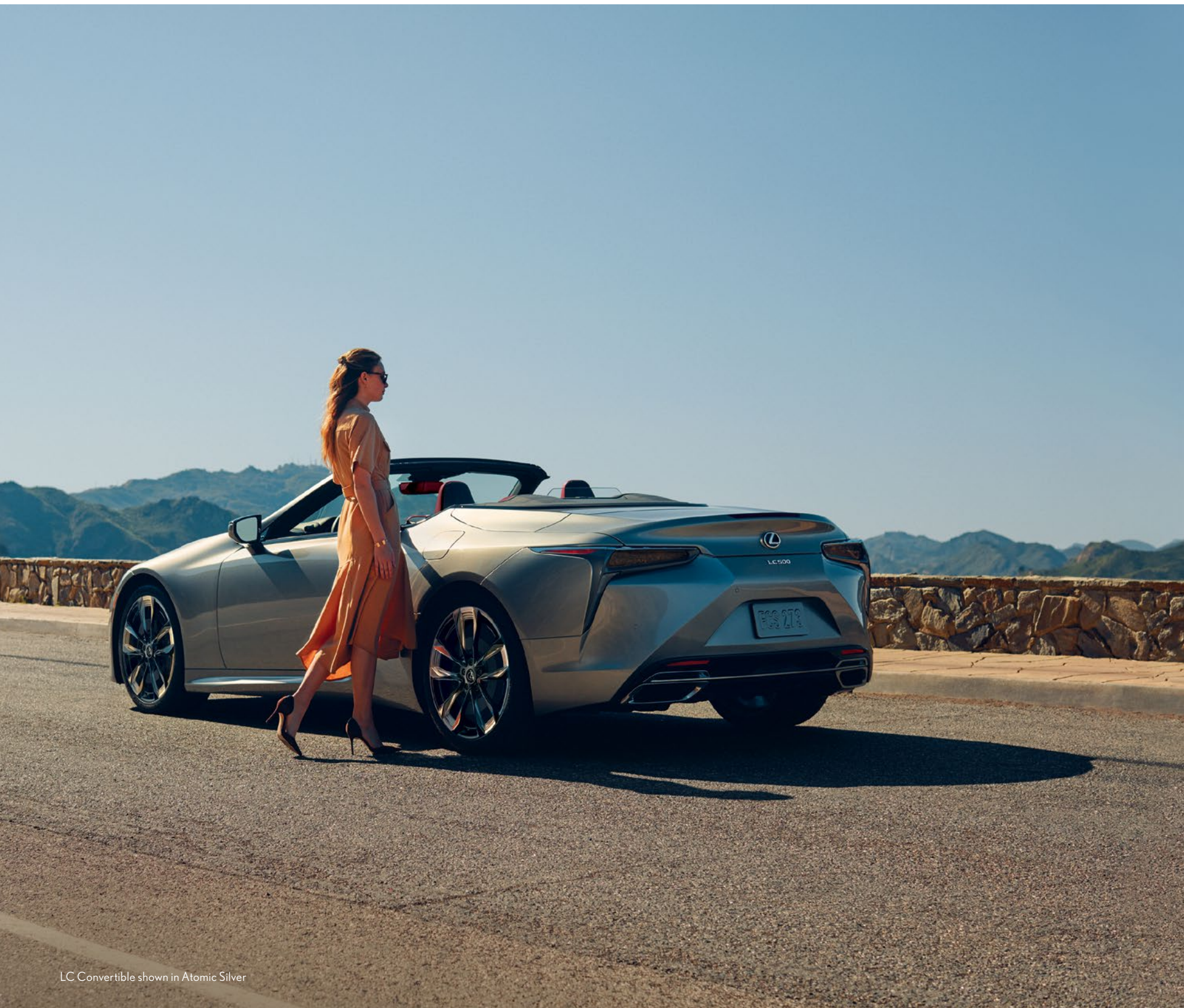
LC Convertible shown in Atomic Silver