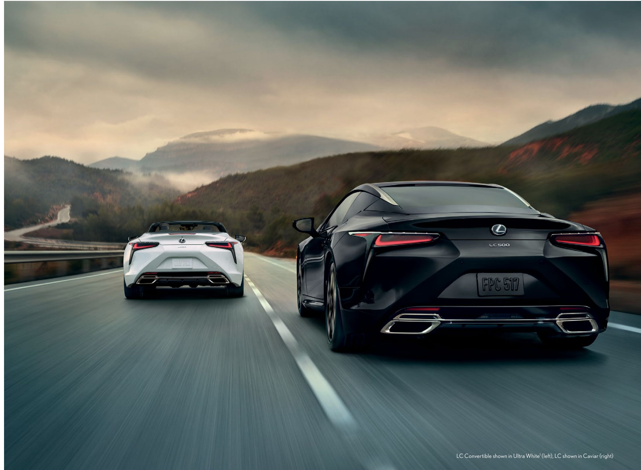
LC Convertible shown in Ultra White 1 (left), LC shown in Caviar (right)

A 10-speed Direct-Shift automatic transmission with magnesium paddle shifters was specifically designed for the LC. It changes gears in 0.12 seconds. Or, half the time it takes the average human to blink. The system also learns your habits every time you drive, selecting the optimum gear based on vehicle speed, acceleration and your driving style—even choosing the ideal gear while cornering.