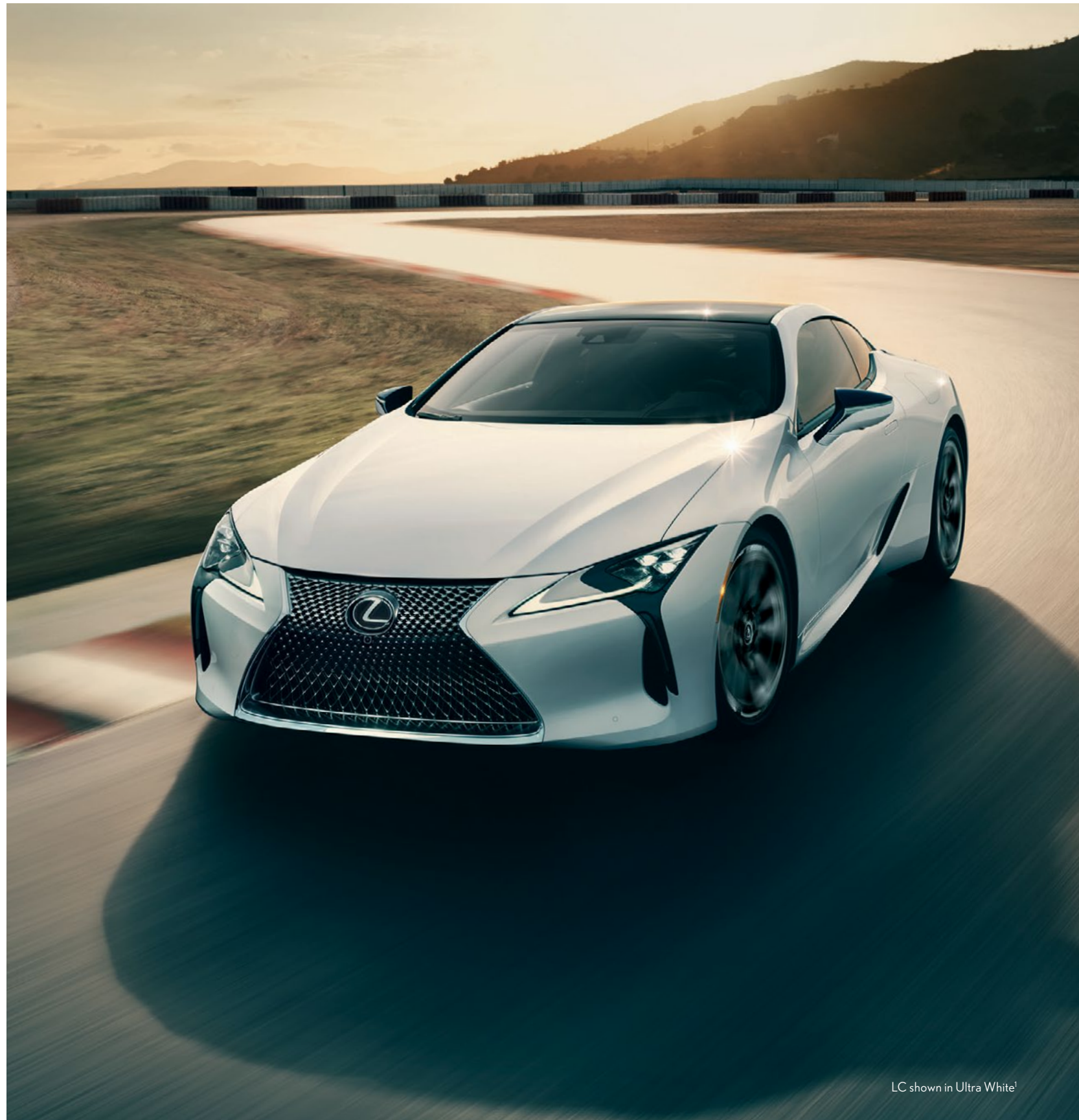
LC shown in Ultra White!