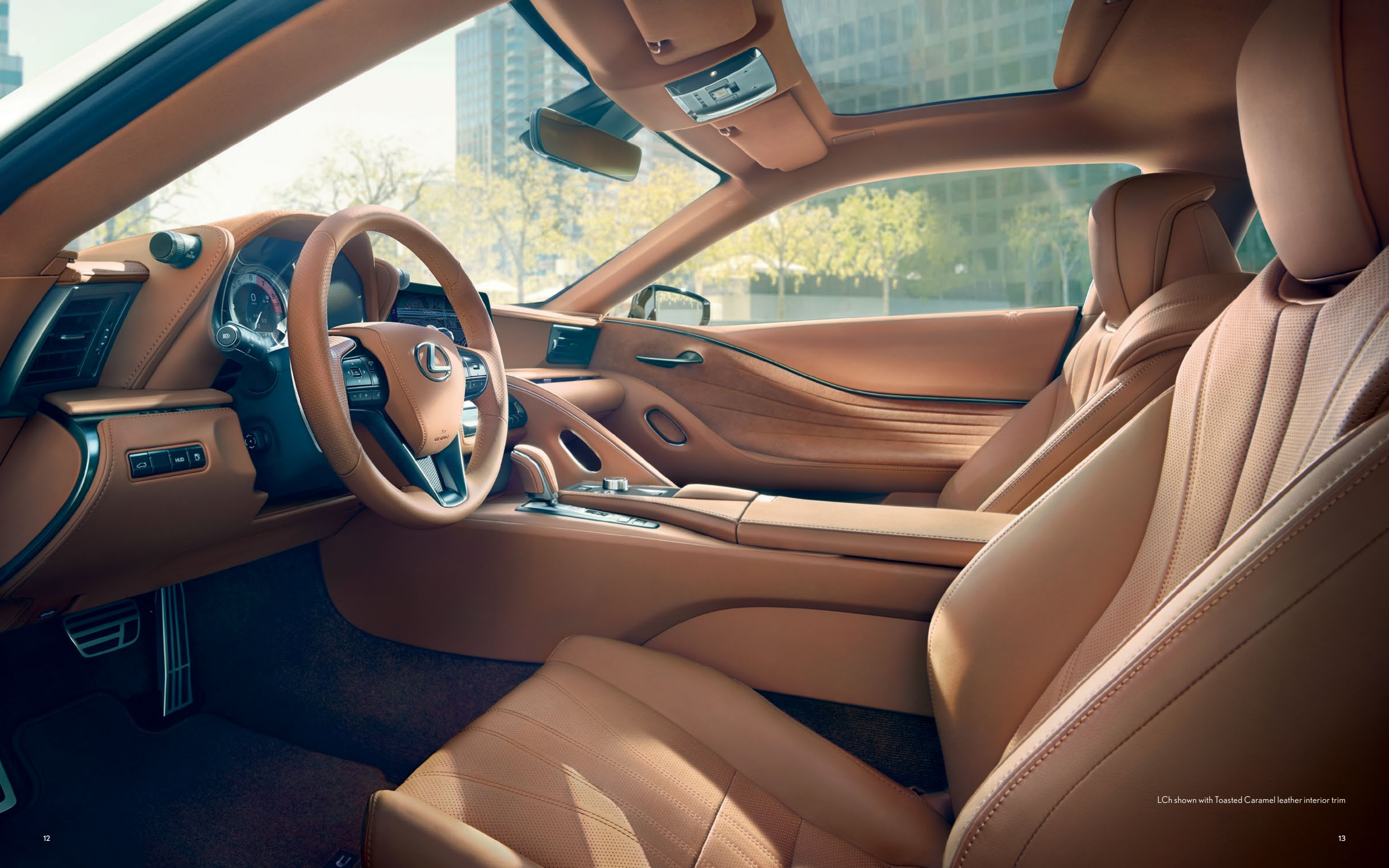
LCh shown with Toasted Caramel leather interior trim