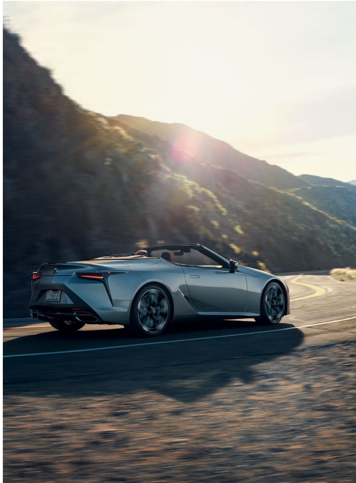
LC Convertible shown in Atomic Silver