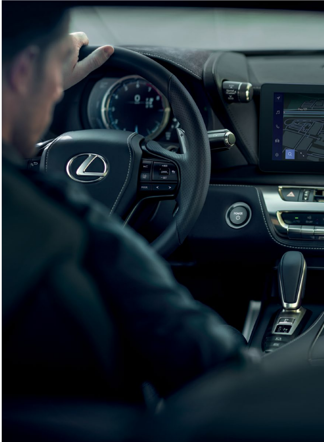
LCh shown with Black leather interior trim