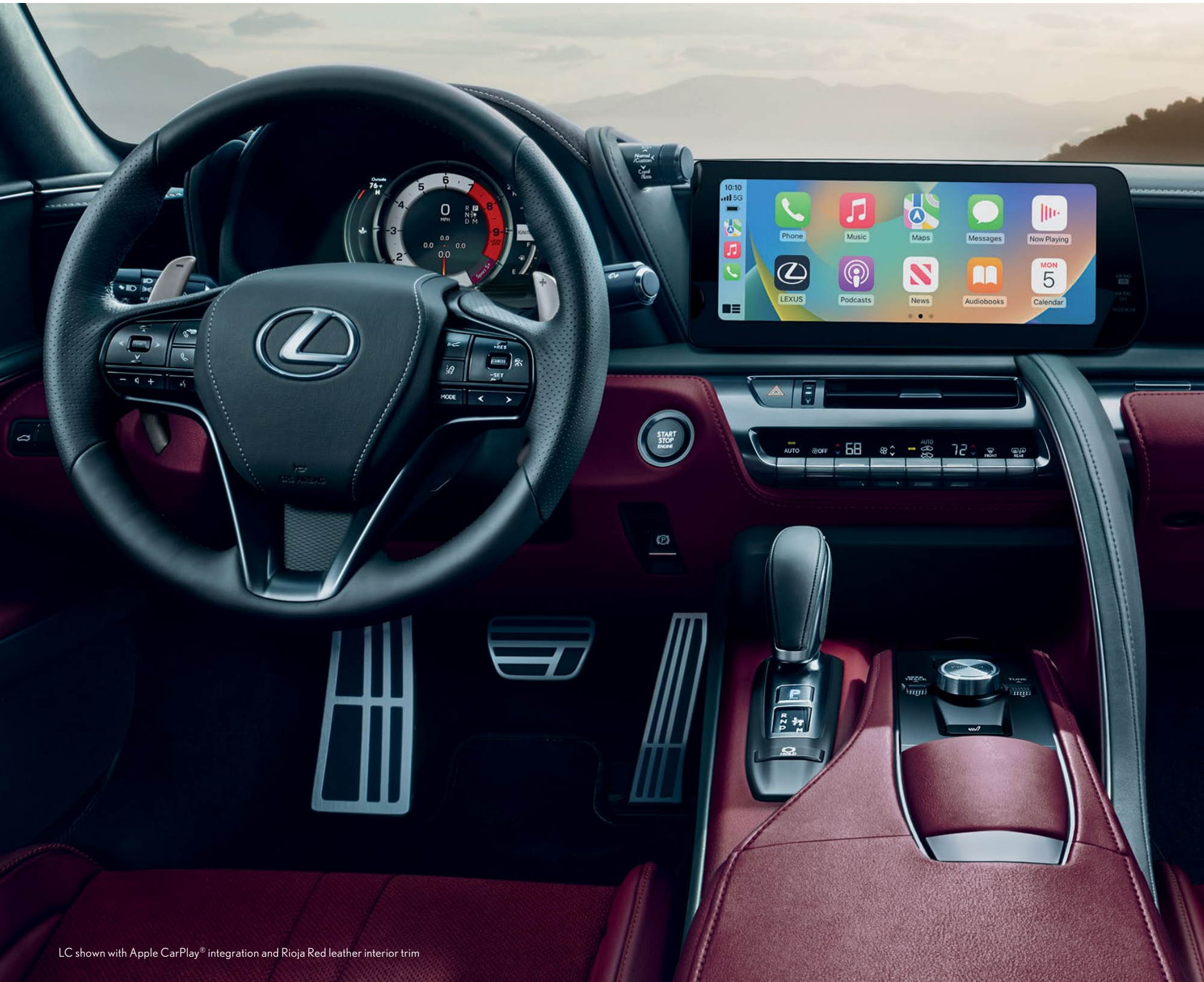
LC shown with Apple CarPlay® integration and Rioja Red leather interior trim