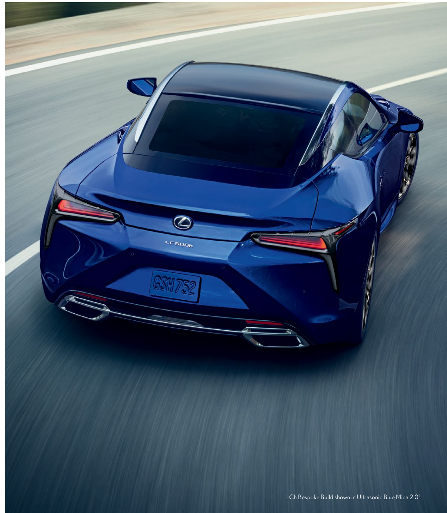
LCh Bespoke Build shown in Ultrasonic Blue Mica 2.0 1