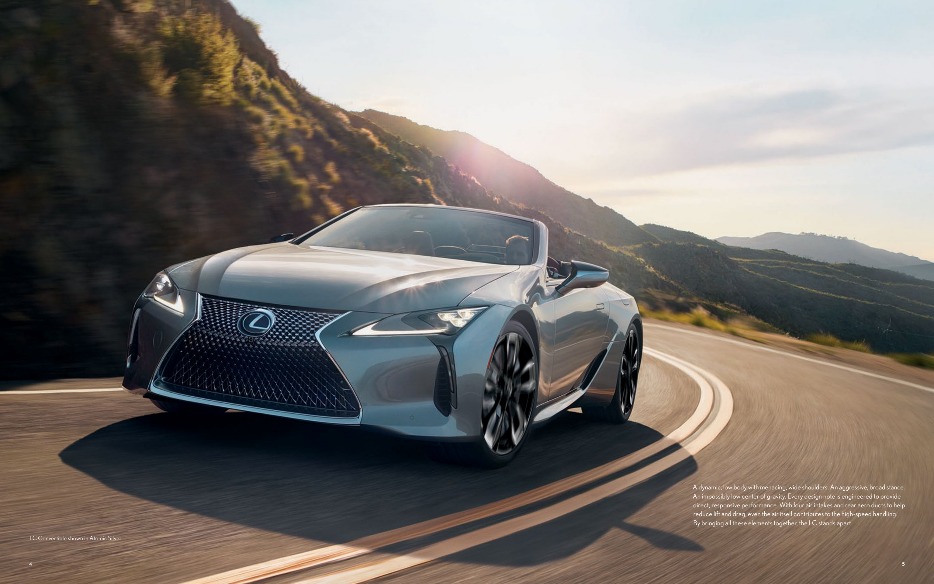
LC Convertible shown in Atomic Silver

A dynamic, low body with menacing, wide shoulders. An aggressive, broad stance. An impossibly low center of gravity. Every design note is engineered to provide direct, responsive performance. With four air intakes and rear aero ducts to help reduce lift and drag, even the air itself contributes to the high-speed handling. By bringing all these elements together, the LC stands apart.